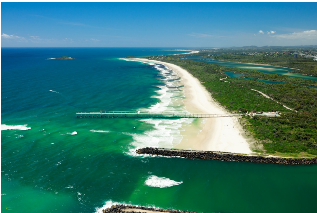
Figure 2: 12087-43