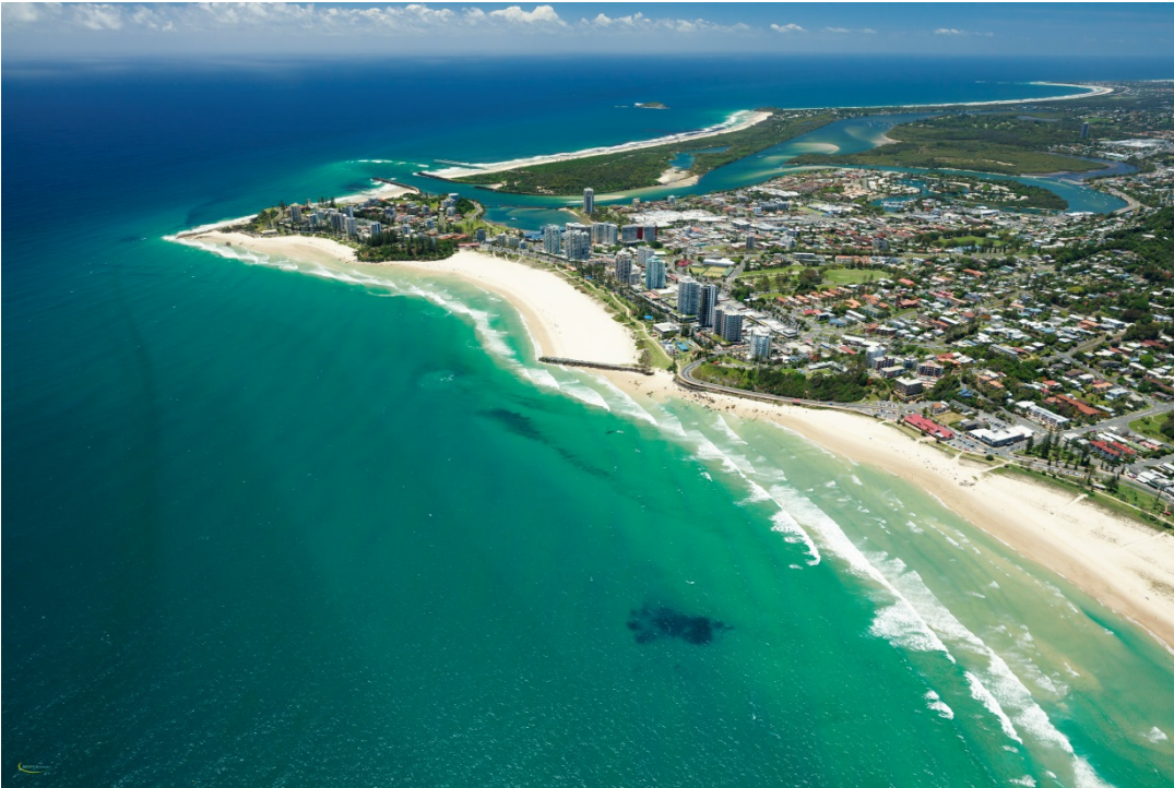
Figure 7: 12089 - 29