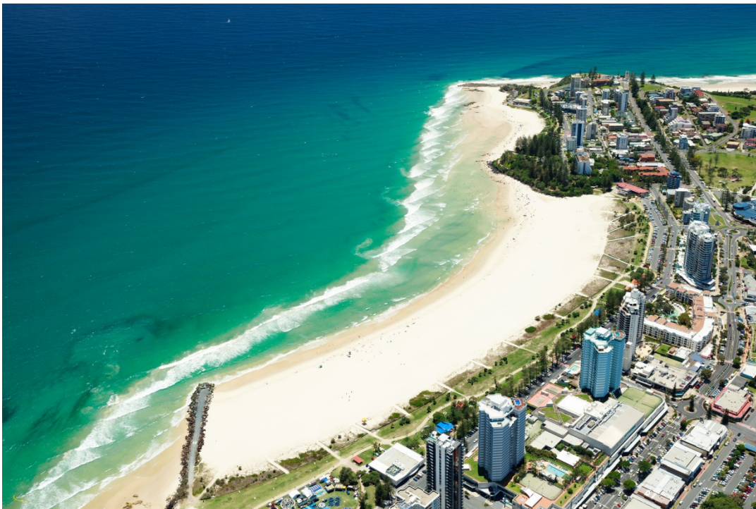
Figure 6: 12089 - 18