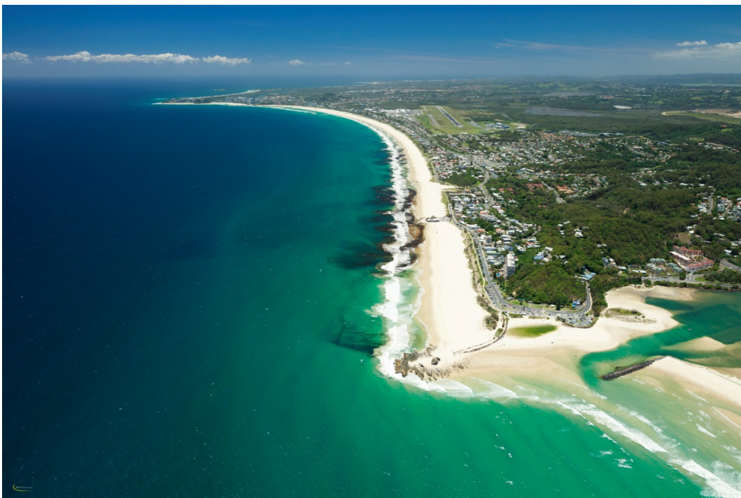
Figure 8: 12090 - 17