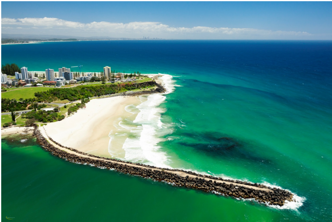
Figure 4: 12088 - 48