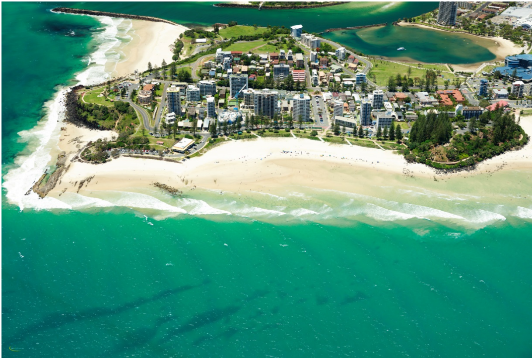
Figure 5: 12089 – 12