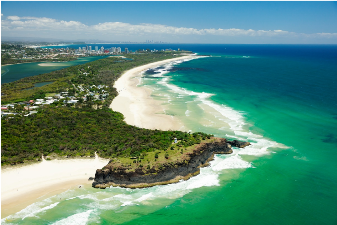
Figure 1: 12087-20