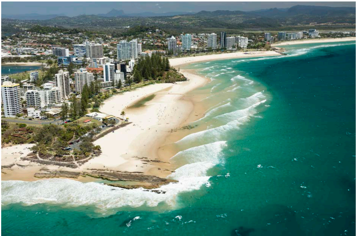
Figure 6 –Snapper Rocks to Kirra