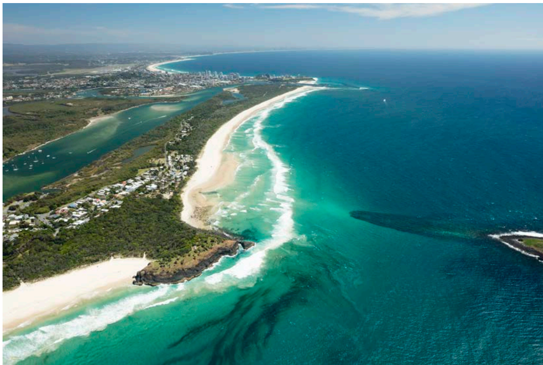
Figure 1 – Fingal Head looking North