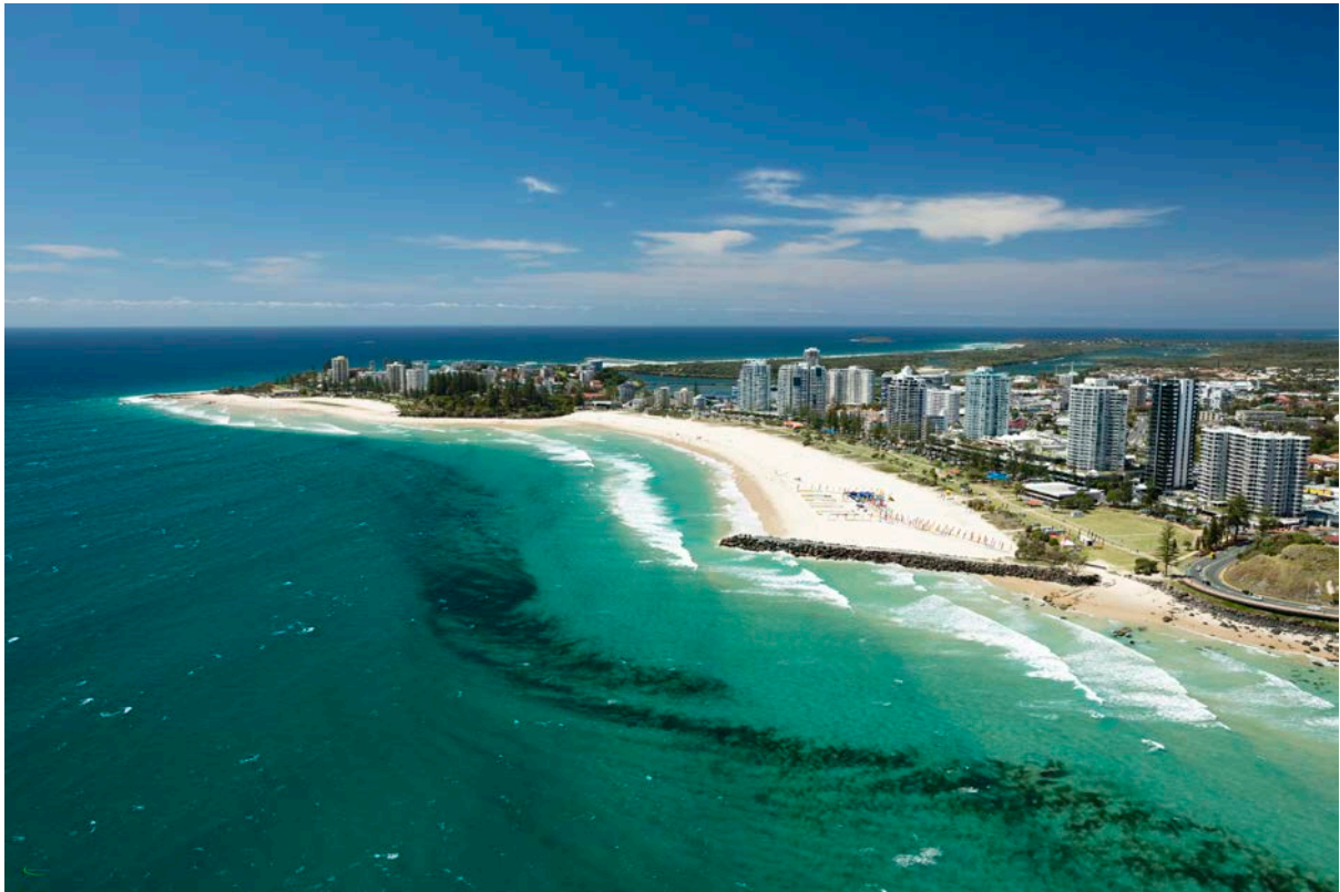
Figure 7 –Kirra looking South