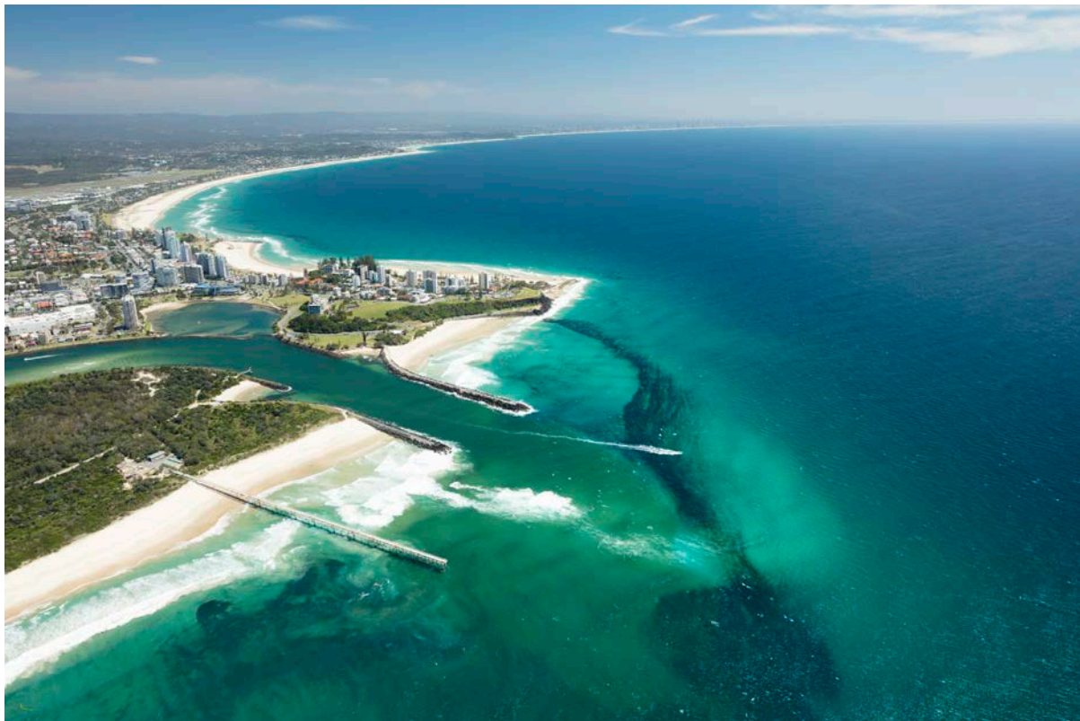
Figure 3 – North Letitia, Tweed River Entrance and Duranbah looking West

North Letitia, Tweed River Entrance and Duranbah