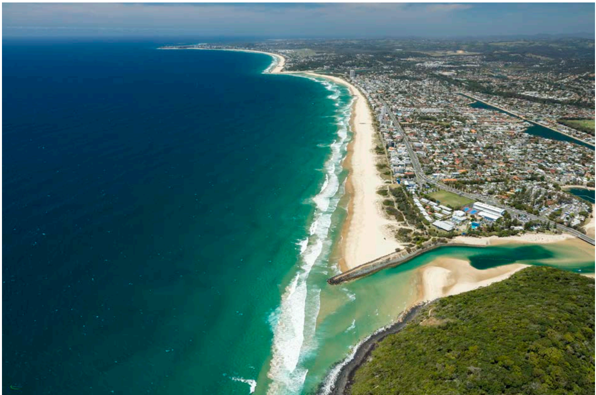
Figure 8 –Currumbin looking South