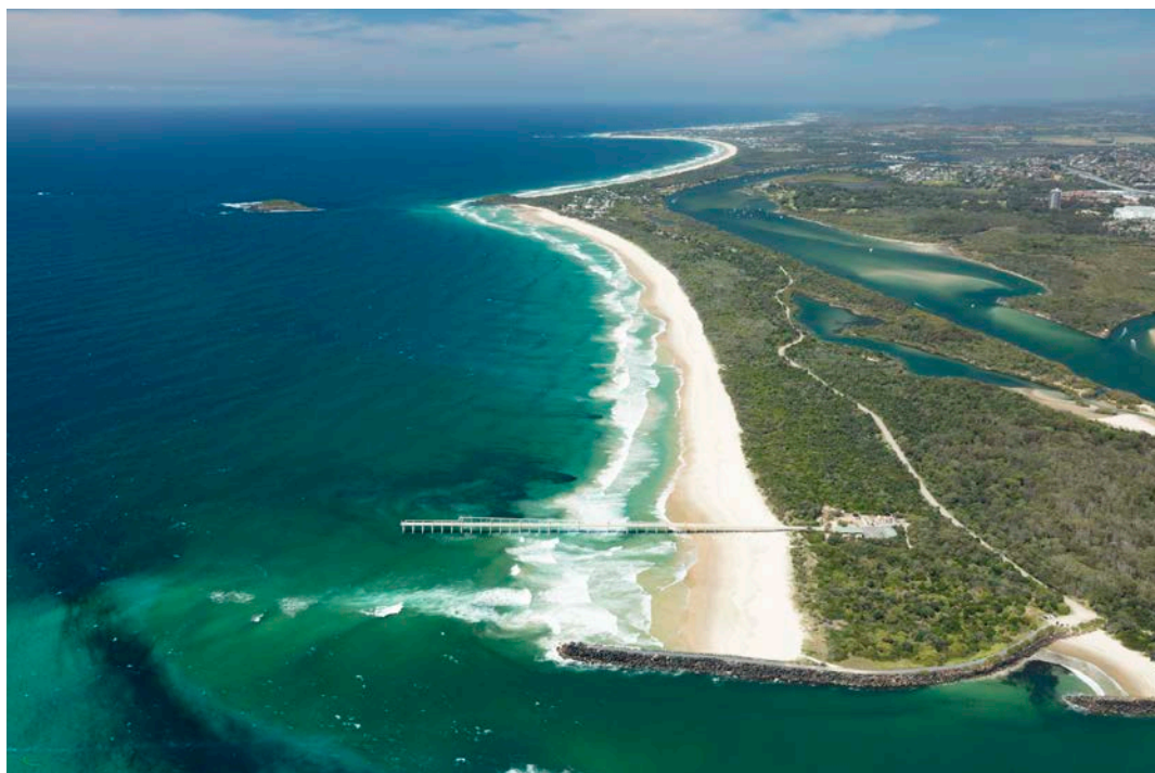
Figure 2 – Letitia Spit looking South