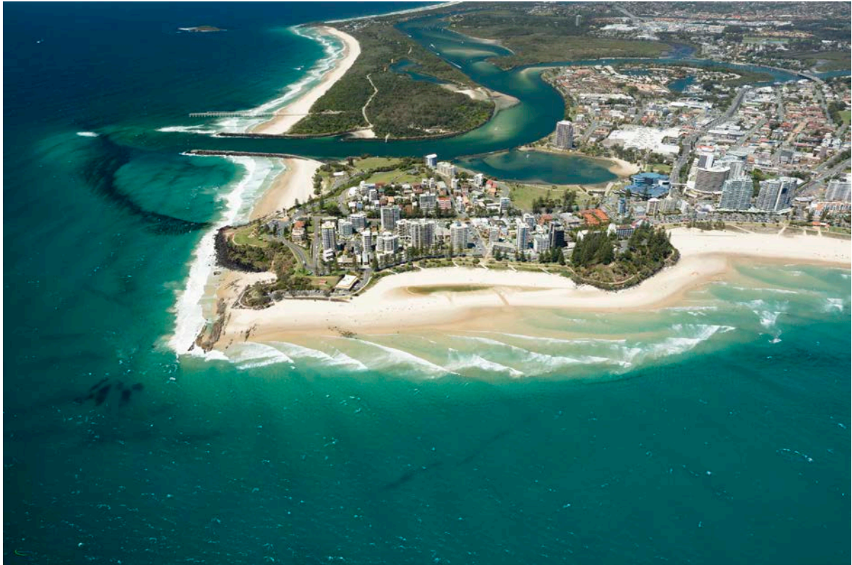
Figure 5 –Snapper Rocks looking South